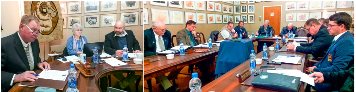
Die Merino Raad in aksie!

The main objectives (according to constitution) of the Merino SA Council are – to encourage the breeding and genetic improvement of production potential of animals in SA; to preserve unimpaired the purity of the SA Merino breed as Landrace in SA and to promote interest in the breed by all possible and available means; to encourage the collection, preservation and development of the breed through sound selection in accordance with the accepted description of a Merino, and to prevent infusion with other breeds; to set up breeding standards based on visual inspection and production traits for genetic defects and conformation, and to maintain it to the extent that it is related to functional efficiency; to compile accurate reports of the pedigrees and details of all animals registered by the Society at the RA in the Studbook, and to preserve and maintain said reports; to encourage production recording and the use thereof in breeding improvement in flocks; to promote and encourage the exhibition and competition of the breed at agricultural shows; to promote the selling of animals and the breed in general.